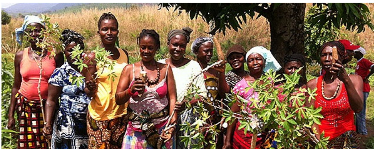
Harvest home in Sierra Leone: the Seeds & Tools project