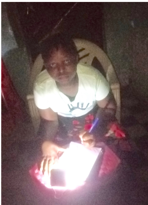
Solar lamps, a brilliant solution for working in the dark